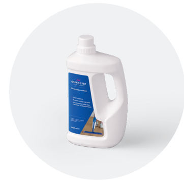
Cleaning product 1 L or 2.5 L QSCLEANING1000 QSCLEANING2500

This cleaning product was specifically developed for Quick-Step floors. It cleans the surface thoroughly and safeguards its original appearance, maximising that 'new floor' experience.