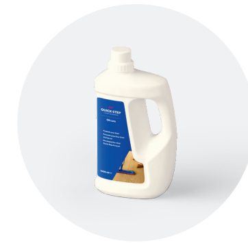
Oil care QSWOILCARE1000

The cleaning kit consists of a mop holder with a refillable water tank and handy lever to easily moisten and mop your floor. Also included: a washable microfiber mop and 1 L of Quick-Step Cleaning product. Now you can clean your floor swiftly and sustainably!