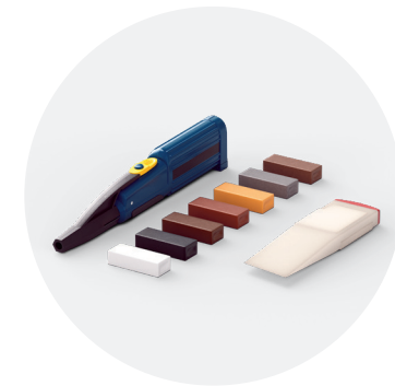
Repair kit QSREPAIR

A sturdy microfiber mop, machine washable up to 60 °C. This mop is compatible with the Quick-Step Cleaning kit.