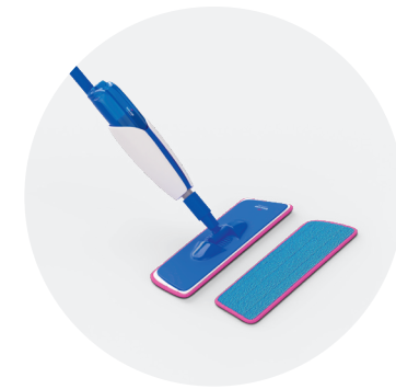
Cleaning kit QSSPRAYKIT

This cleaning product was specifically developed for Quick-Step floors. It cleans the surface thoroughly and safeguards its original appearance, maximising that 'new floor' experience.