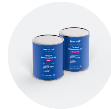
Maintenance oil 1 L QSWMAINTOILN / QSWMAINTOILW

Easily repair light damage and match the original colour of your floor with this kit. For detailed step-by-step instructions, visit quickstep.com .